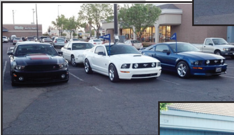
The Metz's GT and GT/CS looking great.