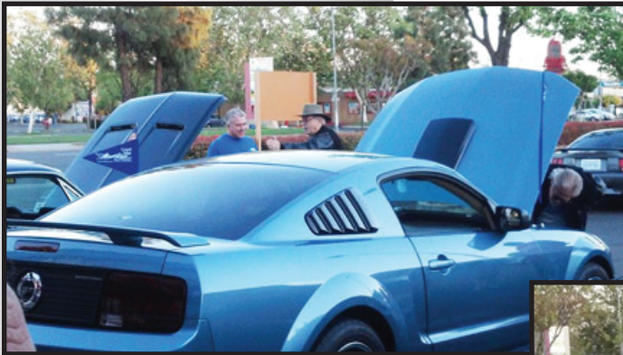
The never ending education.