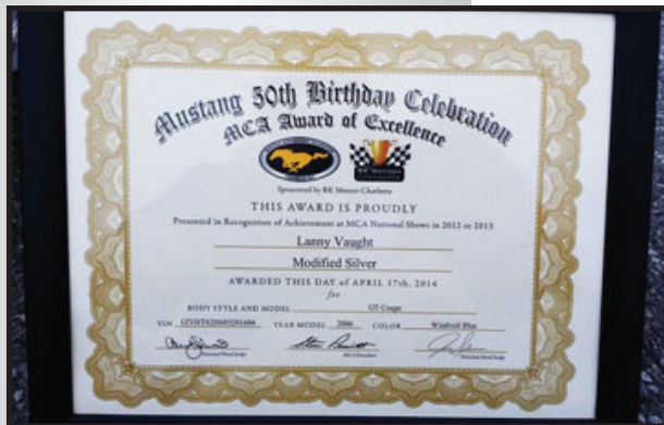
Commemorative Certificate to show participants.