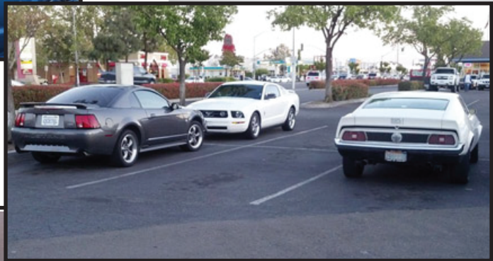
Three generations of Mustangs